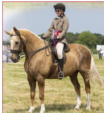
Charlotte and Custard at the Cumberland Show