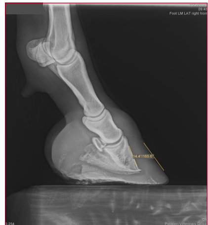
Digital radiograph showing pedal bone rotation

Feed management is important - it is recommended to feed your horse soaked hay (rather than haylage) as this has a lower sugar content. Ideally, hay should be soaked for 12 hours before feeding. An obese pony needs approximately 1.5% of their body weight as soaked hay each day. Unfortunately, soaking hay results in leaching of many important vitamins and minerals, so a low calorie balancer should be fed! If the horse is to be turned out, a grazing muzzle should be used as this restricts the amount of lush, sugar filled grass which can be eaten each day. The sugar content of grass is less during the night, so one option is stabling during the day and turnout at night.