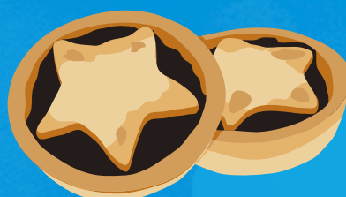
Christmas pudding, cake and mince pies