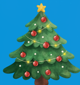
Baubles, fairy lights, tinsel & ribbon