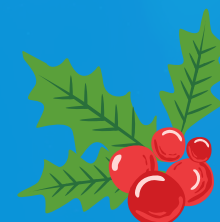
Poinsettia, holly, ivy and mistletoe