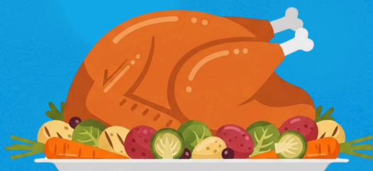
Fatty foods such as gravy, stuffing and turkey skins