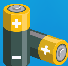
Batteries & toys