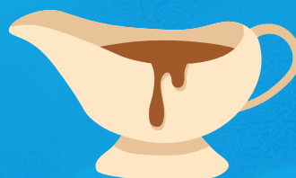
Onion, including gravy and stuffing